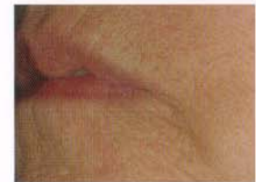
3 months after treatments

Skin tightening around the eyes reduces crow's feet and improves skin texture. Treatment around the mouth shows reduced marionette lines and improvement in skin texture and perioral wrinkles.