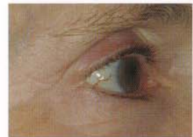
3 months after treatments